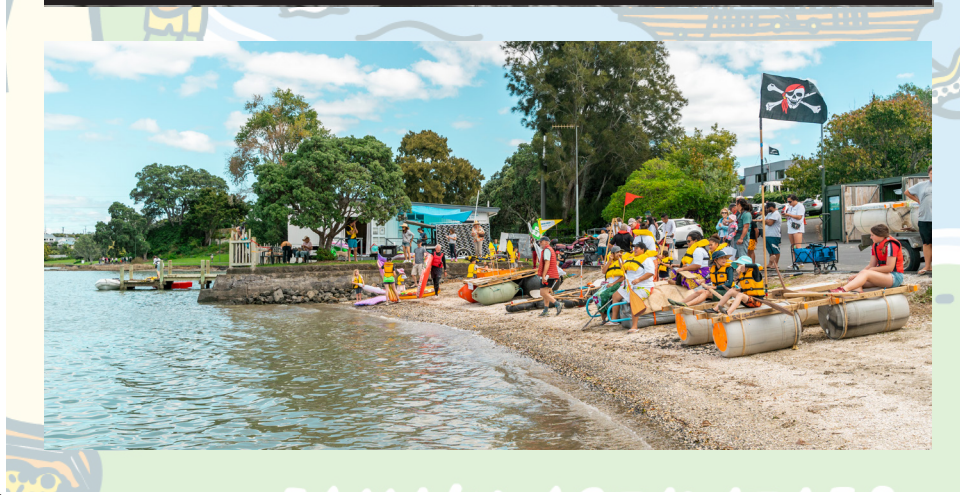
'Raft day', Panmure, 1985

Since its inception in the 1960s, this family-friendly event has brought plenty of smiles and laughter to participants and spectators alike. To enter, you'll need a $10 registration fee, a team of 2 to 5 and a raft made out of 80% recyclable products. The goal is to paddle around a designated buoy and back; and while there can only be one victor, there are plenty of great prizes for the fastest raft, most innovative, the Titanic raft and more! The 2023 race will be held at 1pm down at the Panmure Basin, Sunday 26th February.