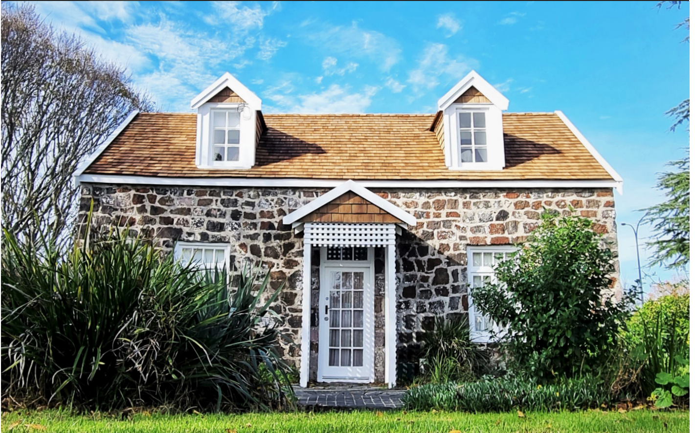
Panmure Stone Cottage 1 Kings Road, Panmure