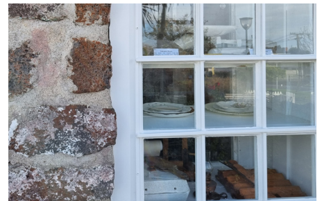
Stone Cottage - After Restoration