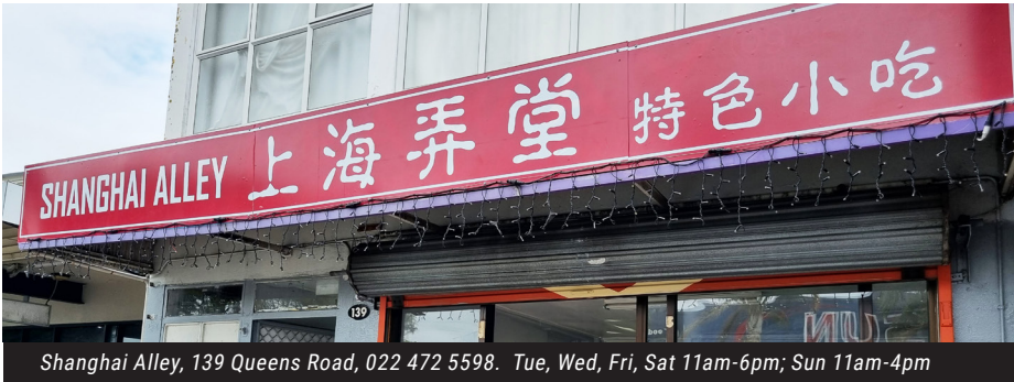
Shanghai Alley, 139 Queens Road, 022 472 5598. Tue, Wed, Fri, Sat 11am-6pm; Sun 11am-4pm