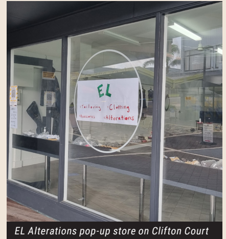
EL Alterations pop-up store on Clifton Court