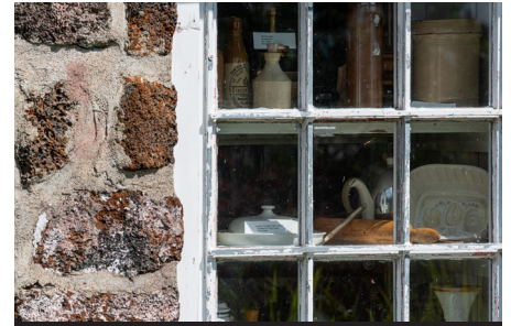
Stone Cottage - Before Restoration