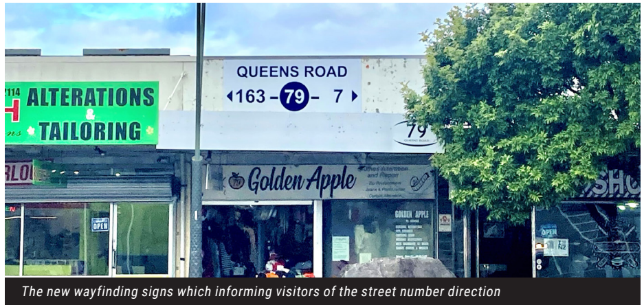
The new wayfinding signs which informing visitors of the street number direction