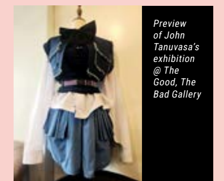
Preview of John Tanuvasa's exhibition @ The Good, The Bad Gallery