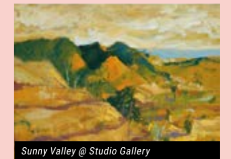
Sunny Valley @ Studio Gallery

Be sure to visit these galleries and experience the vibrant art on display before these fantastic exhibitions come to an end!