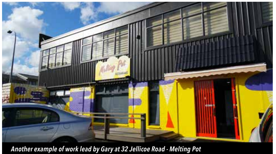
Another example of work lead by Gary at 32 Jellicoe Road - Melting Pot