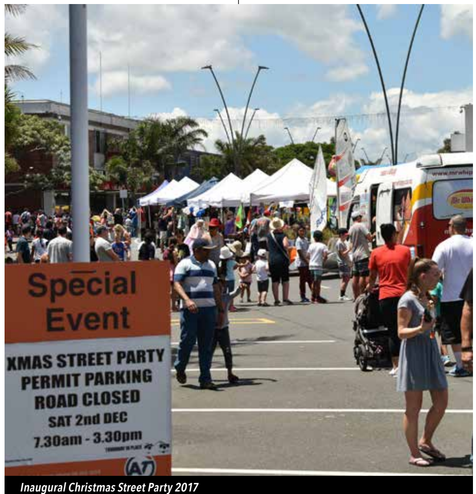
Inaugural Christmas Street Party 2017