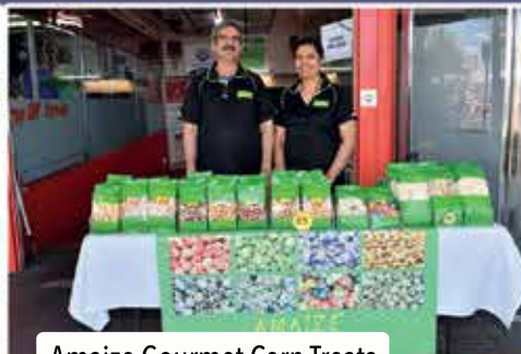
Amaize Gourmet Corn Treats