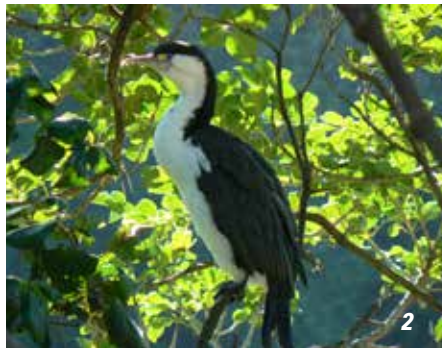
2&3. Pied Shag or Cormorant Karuhiruhi - Caring for a protected species