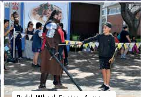
PaddyWhack Fantasy Armoury

Register your interest now! communications@panmure.net.nz or 09 527 6389 *First in first served basis, limits apply. Offer open to PBA Members only.