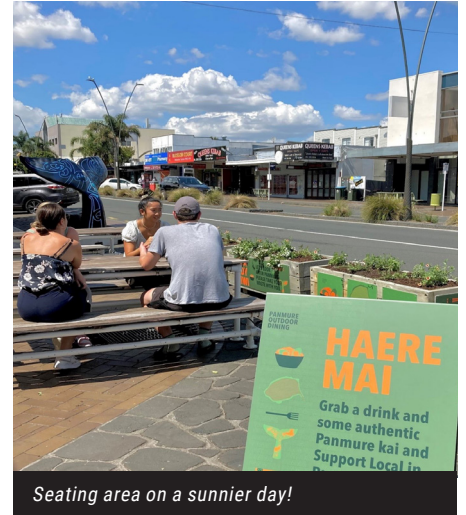
Seating area on a sunnier day!

Colombo Cafe, at the top of Basin View Lane. The seating areas are for everyone to enjoy - not just for diners, or for the businesses in the immediate vicinity, they are available to all in Panmure. The Trial will be during the summer months. If you have any feedback regarding the seating, please do not hesitate to contact the PBA staff, we will be forwarding all feedback on to Eke Panuku – your comments are an important part of the trial.